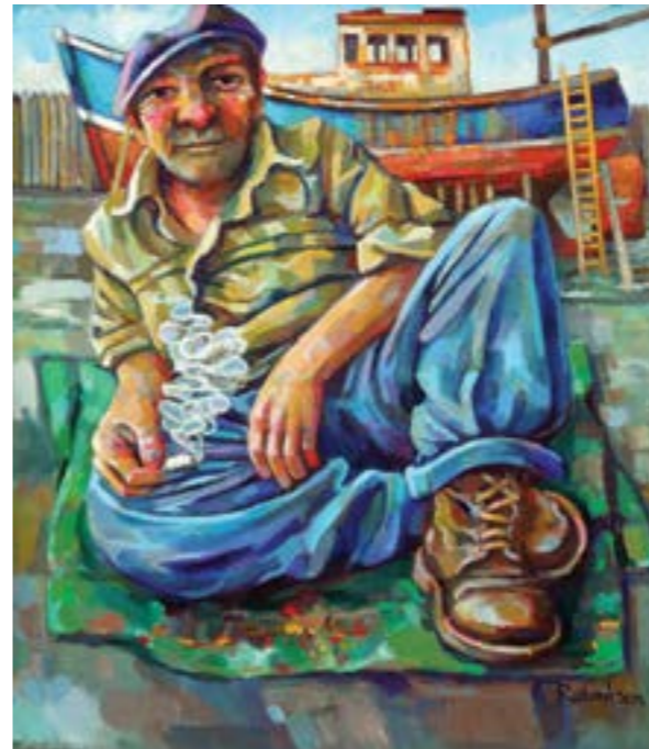
Boatyard Break 18" x 16"