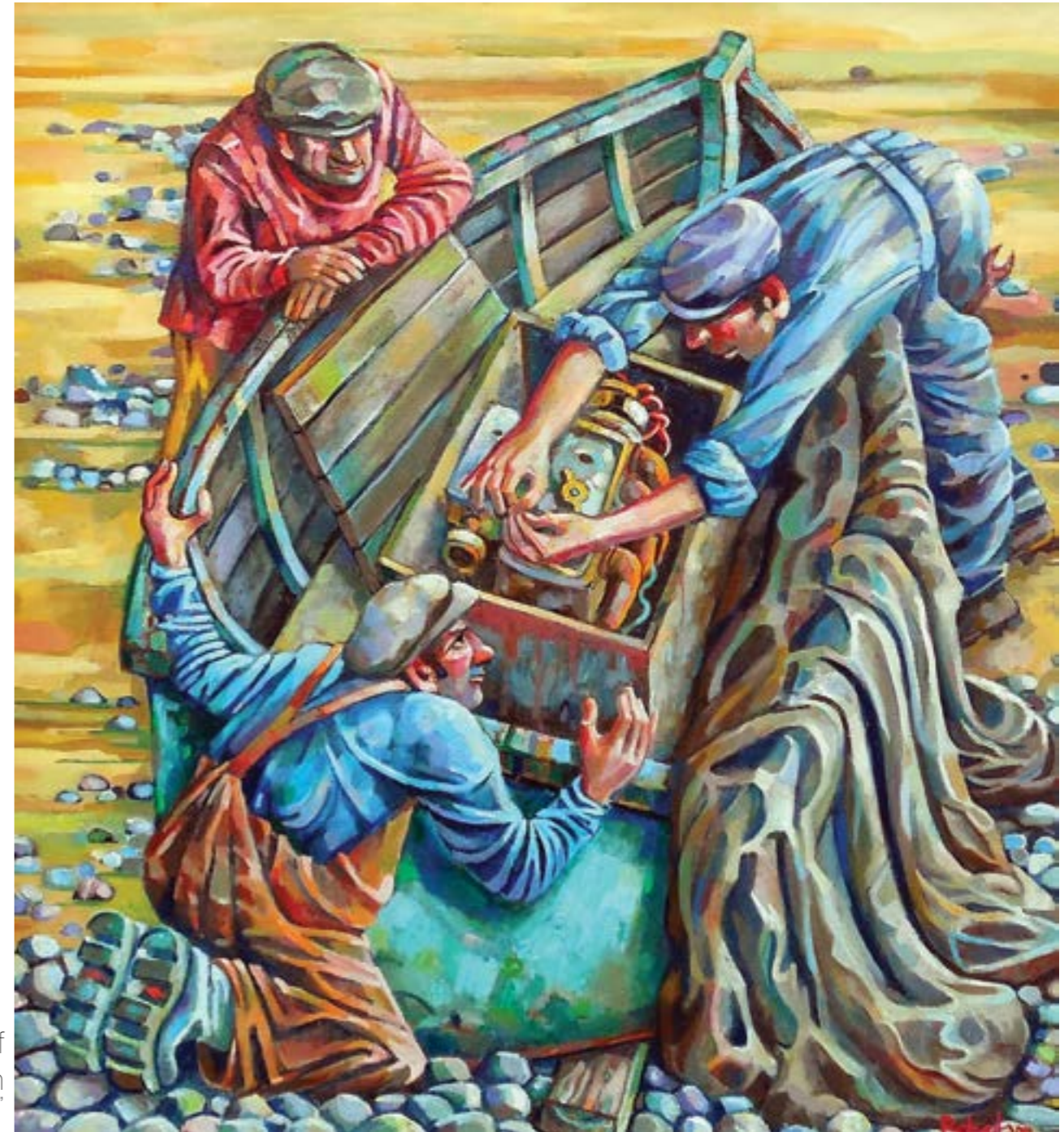
The start of the season 28" x 26"