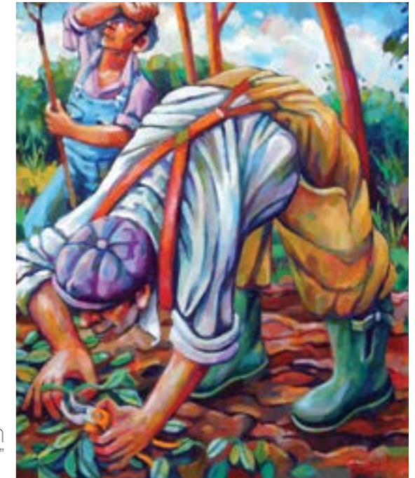
In The Garden 18" x 16"