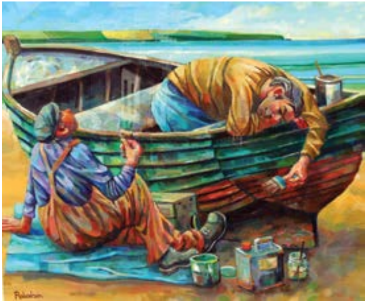
Painters 20" x 24"