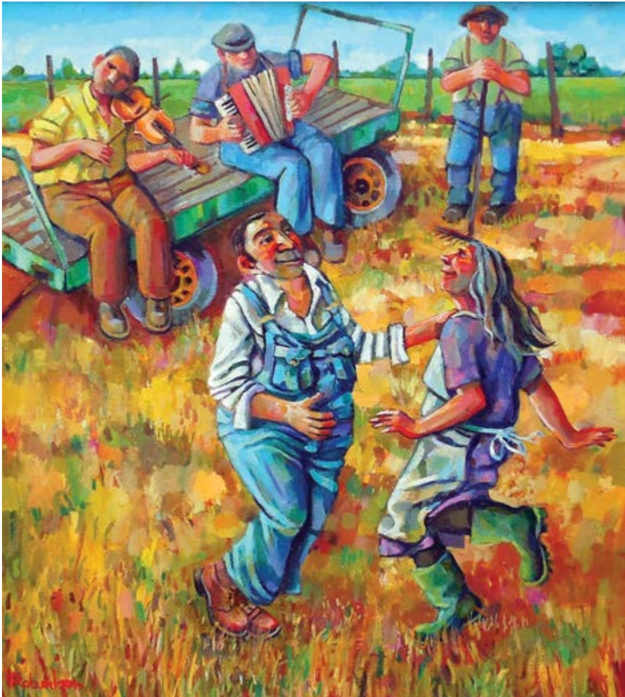
Harvest Time 24" x 22"