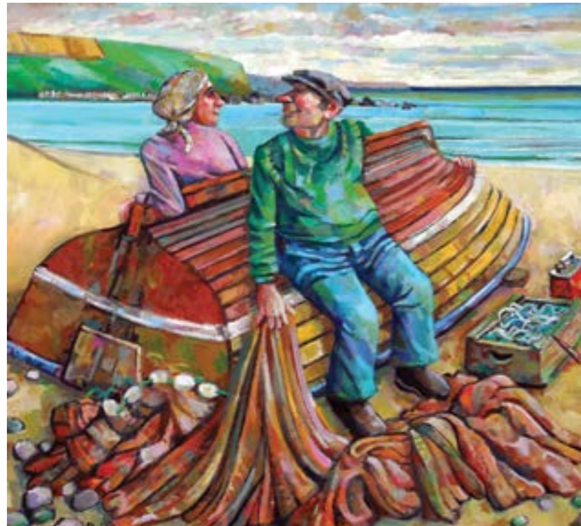
Soulmates 20" x 22"