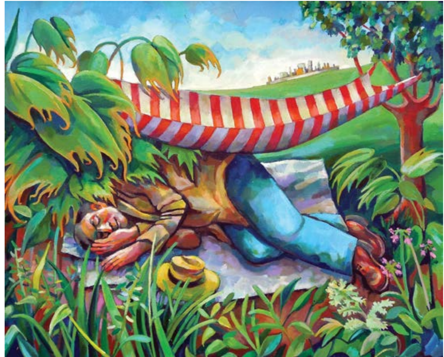
The Lord prepared a gourd (Jonah) 20" x 24"