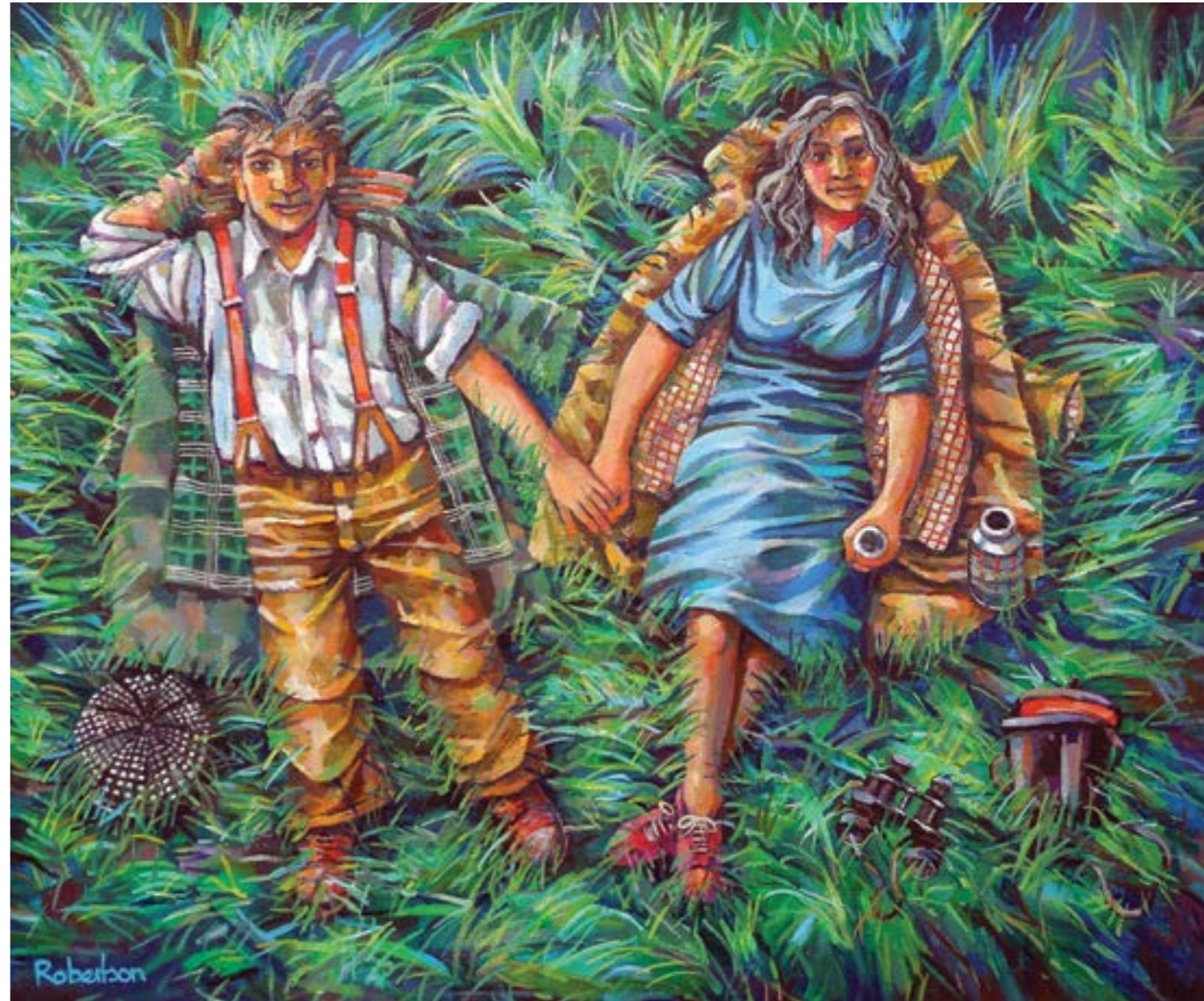
Stargazers 20" x 24"