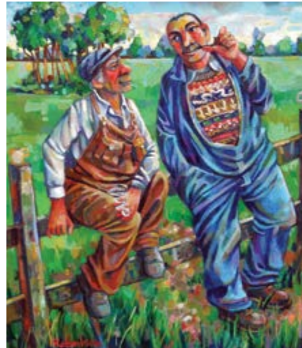
Harvesters 20" x 18"