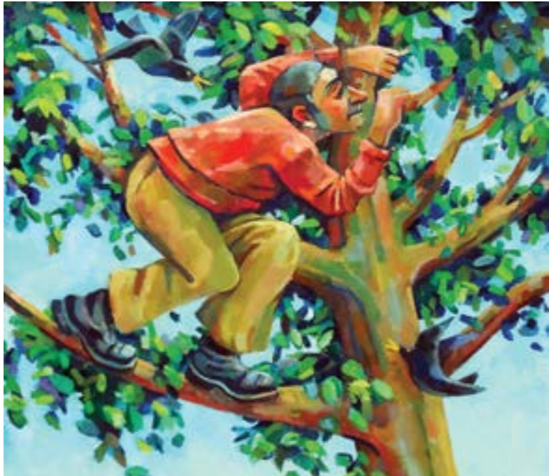
Birdnester 16" x 18"