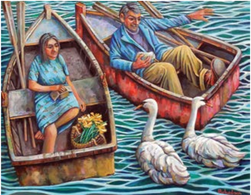
Feeding the swans 24" x 30"