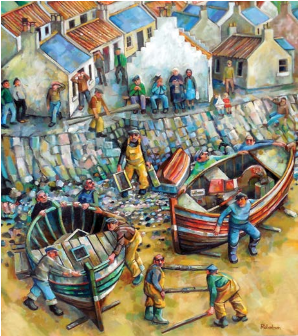
The day the whales came 36" x 32"