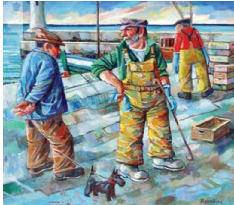
Harbour talk 20" x 22"