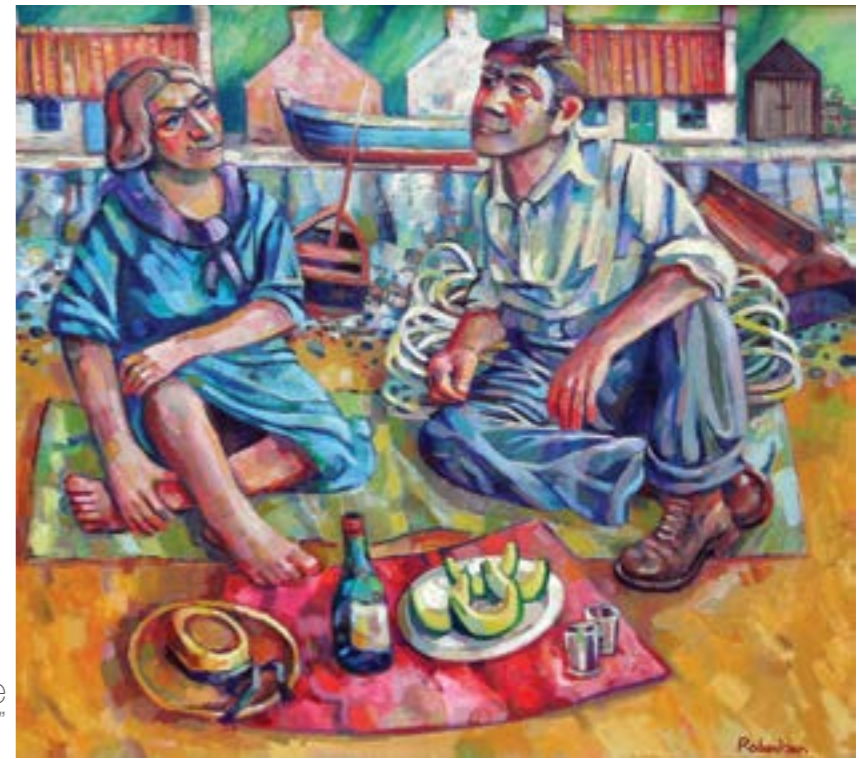
Shoreline 20" x 24"