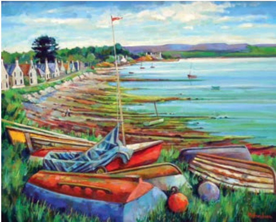
Findhorn Bay 24" x 20"