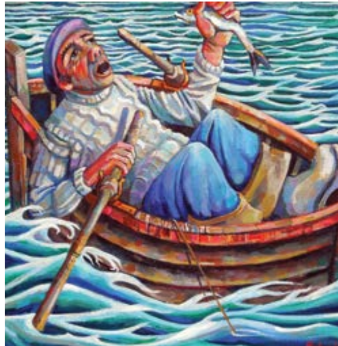
With all his heart he sang (Top right) 18" x 20"