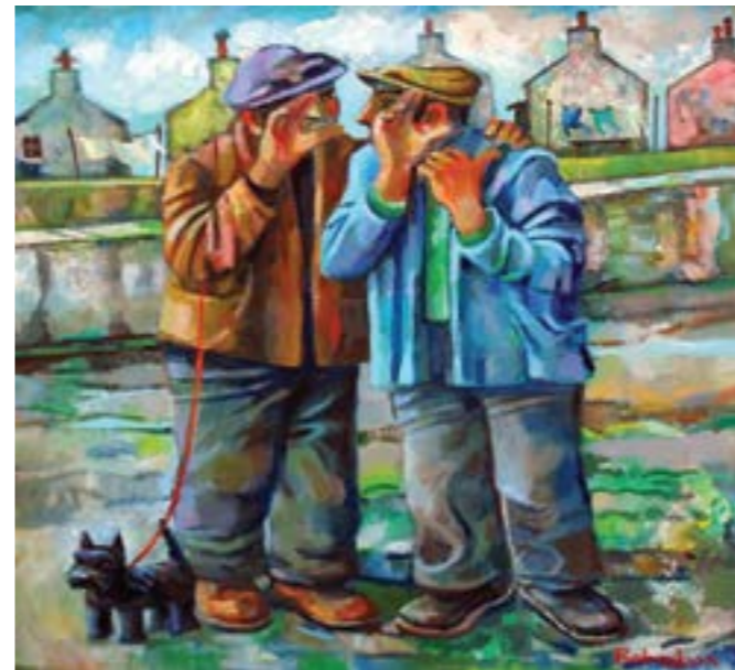
Gossip 18" x 16"