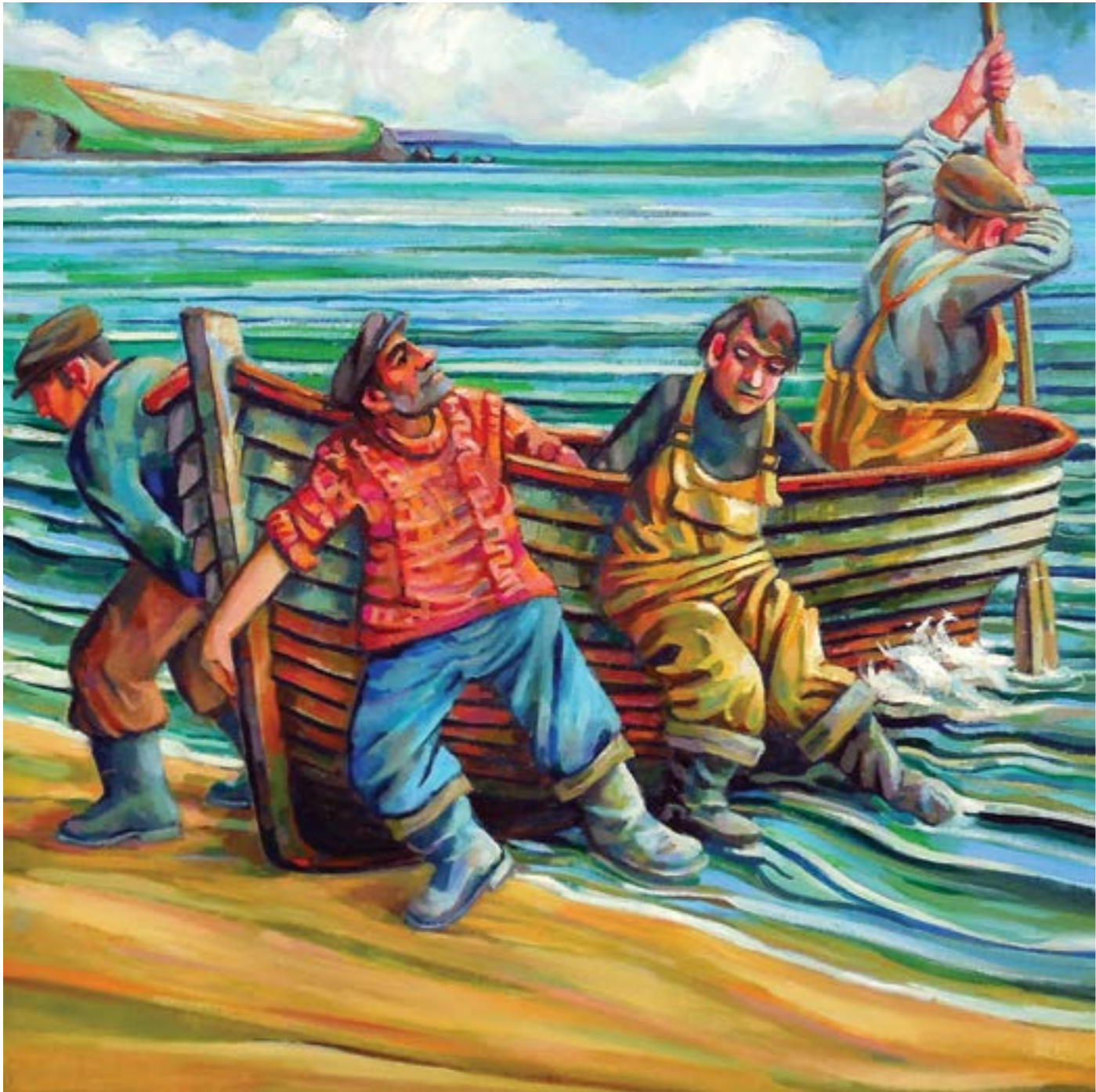
Return 24" x 22"