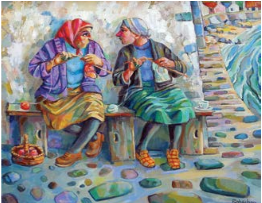
Seatown knitters 20" x 22"