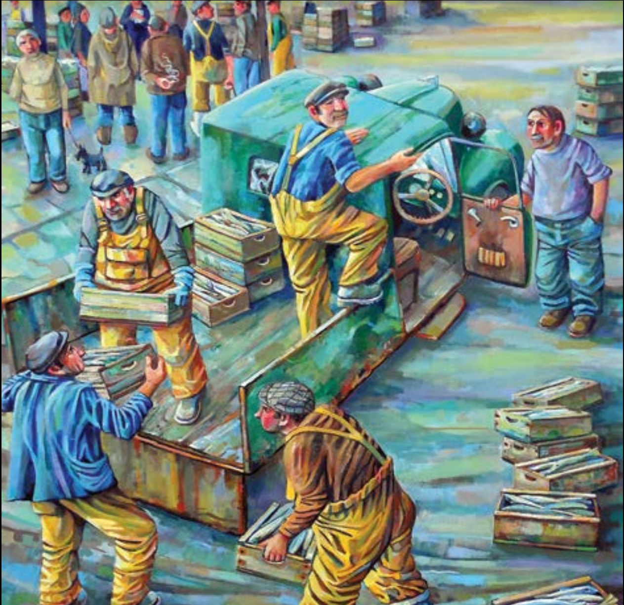
Fish Lorry 40" x 36"

“The kindness of friends and the warmth of toil and the peace of rest”