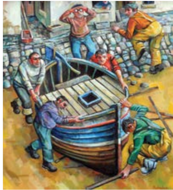
Something on the horizon 24" x 22"