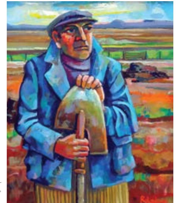
Peat Cutter 14" x 12"