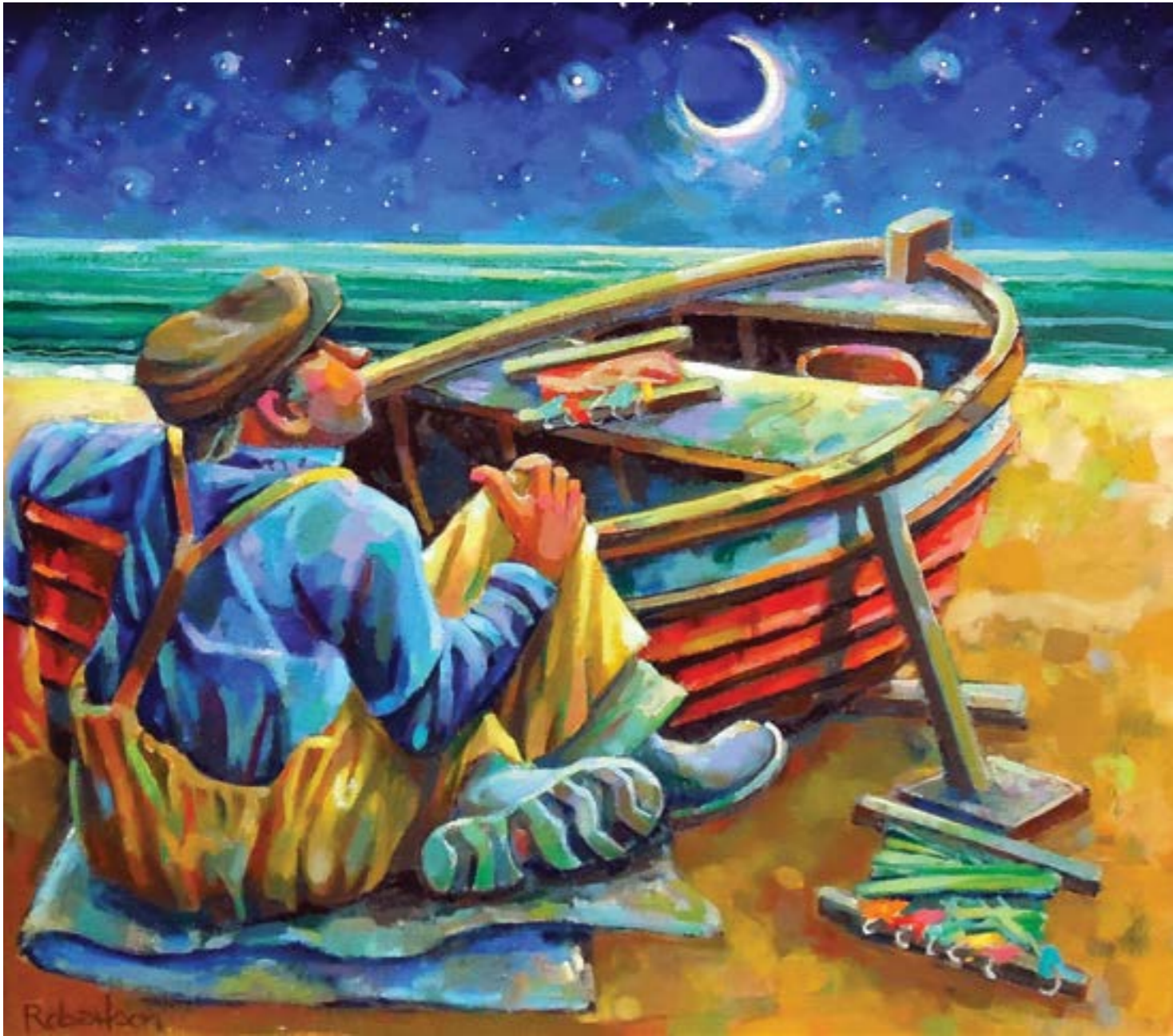
Evening 18" x 16"